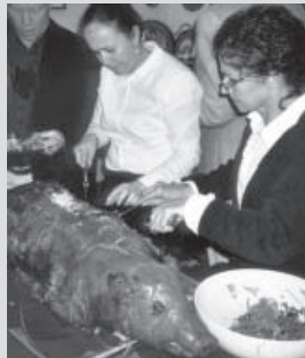
Roast pig, a typical Cuban delicacy.